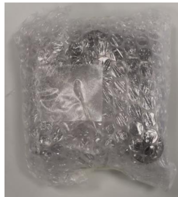
Figure 4: Packed green part and shrinkage plate

In the case of thin parts like tensile bars it is recommended to wrap them one after the other in bubble wrap as shown below.