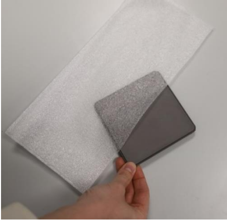
Figure 2: Wrapping the shrinkage plate in the film