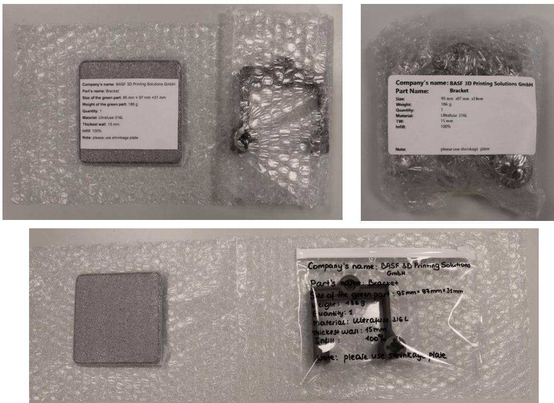
Figure 6: Different possibilities of parts labelling: adding a note (top left); using a printed label (top right); labelling with a foil pen (bottom).