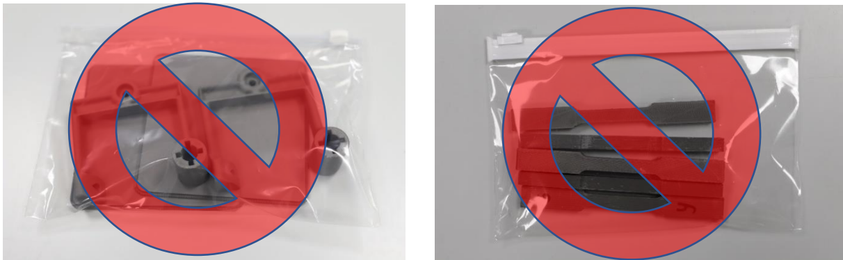
Figure 1: Example how the green parts should not be packed

We strongly recommend packing the green parts individually. No matter what packaging material is used, green parts not packed individually can damage each other during shipment.